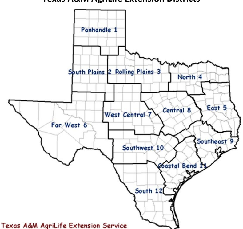
Texas A&M AgriLife Extension Districts