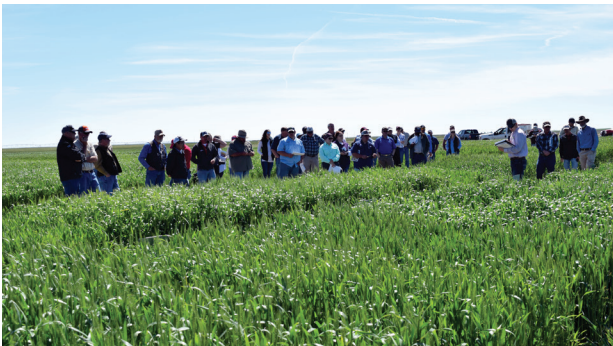
Wheat plots at 3B Farms near Dalhart